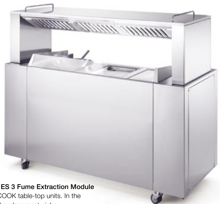
BLANCO COOK BC ES 3 Fume Extraction Module with three BLANCO COOK table-top units. In the usable space below the placement niche: BLT 420 KBRUH (can be heated and regulated) and BLT 420 K food transport containers on castors.