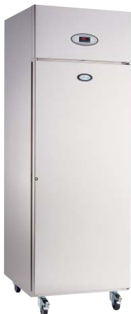
top mount models for maximum storage capacity

New radiused door edge for improved ergonomics