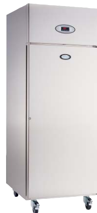
lower height top mount model PRO G 400