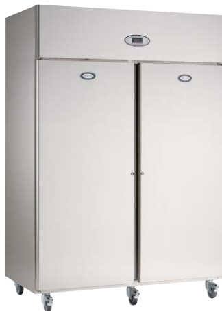
double door models for maximum storage space on a given footprint