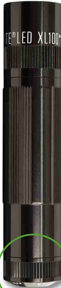
Shown Actual Size (approx.)

Rotate Left or Right For Variable Power Level and Strobe Rate Settings MAXIMUM TO MINIMUM