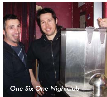
One Six One Nightclub

Trial feedback has shown that whilst the Y generation appreciate the use of BottleCycler as it makes their work easier, less dangerous and less physically demanding, they love it because they are environmentally aware and do care about recycling.