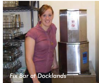
Fix Bar at Docklands

Trial feedback has shown that whilst the Y generation appreciate the use of BottleCycler as it makes their work easier, less dangerous and less physically demanding, they love it because they are environmentally aware and do care about recycling.