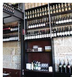
◀ Mille Vini - 1000 wines - in Surry Hills

And Maggies , a small venue leading the way in recycling in Kings Cross.