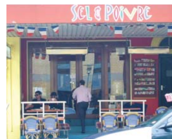
▲ Sel & Poivre in Darlinghurst

Sel & Poivre in Darlinghurst have been enjoying BottleCycler for some time and new users include the bustling new wine bar in Crown Street, Surry Hills - Mille Vini who have an extensive wine selection from around the world.